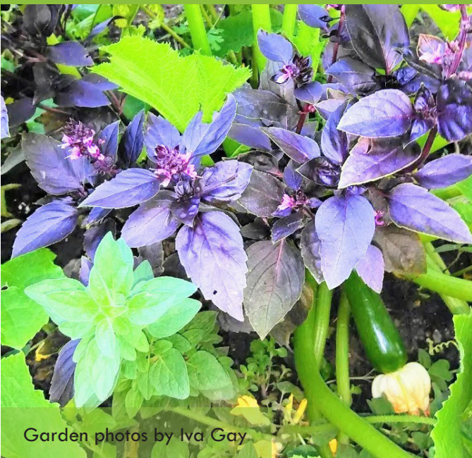
Garden photos by Iva Gay

The property on Hulett St. is possible through a partnership with Duryee Memorial AME Zion Church.