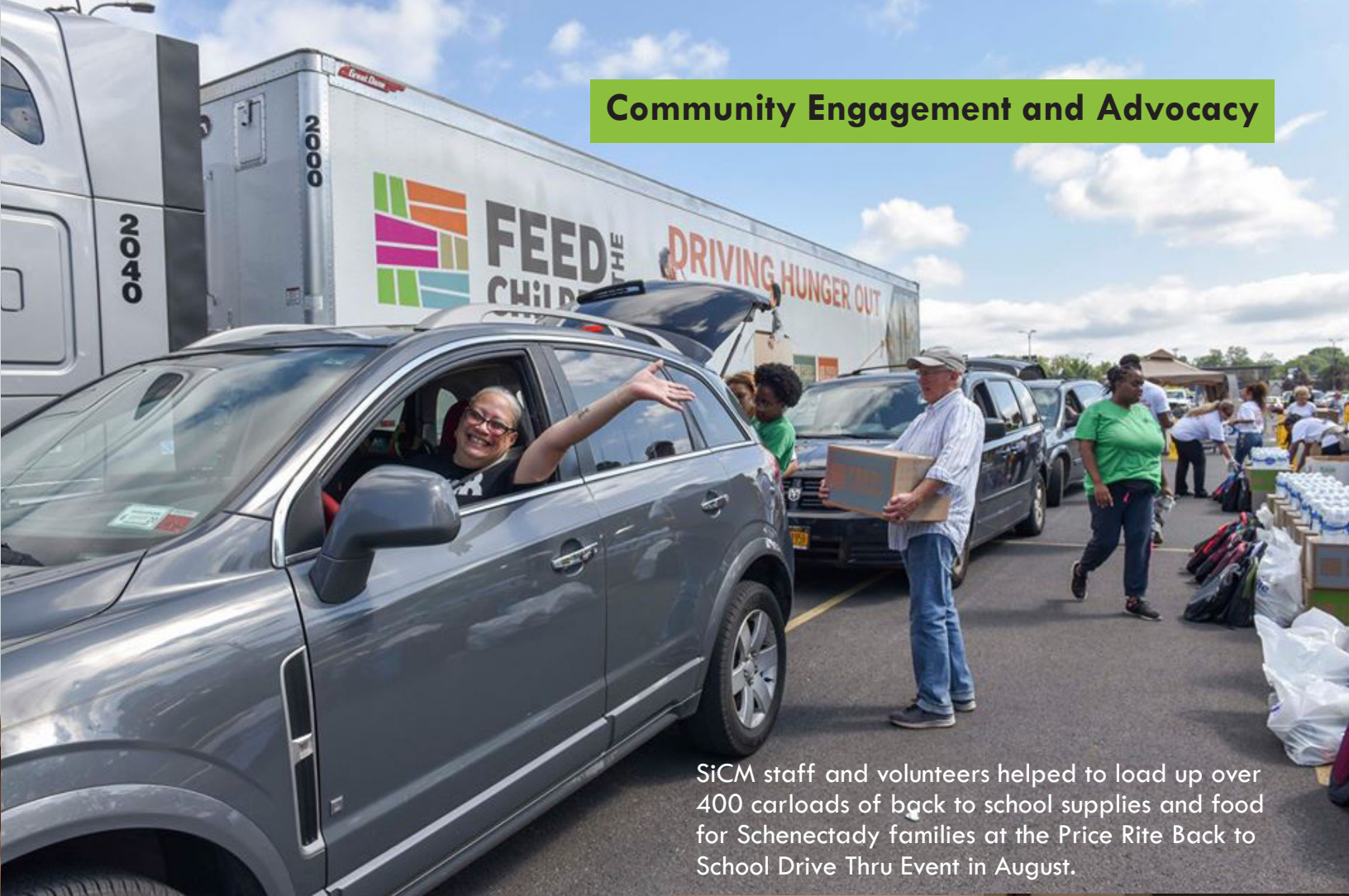
SiCM staff and volunteers helped to load up over 400 carloads of back to school supplies and food for Schenectady families at the Price Rite Back to School Drive Thru Event in August.

The Development Department managed the following events: SouperBowl Sunday, The Empty Bowls Project, Schenectady CROP Hunger Walk, SPAC Summer Nights, Open Door Fundraiser, Music Company Orchestra Concert, and Holiday and Awards Celebration.