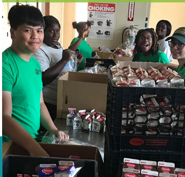
Interns, volunteers and staff prepare mobile lunches for summer meals.

Ensure that high priority children of Schenectady receive a nutritious meal during the summer.