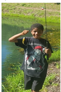
Fishing time with campers!

The camp is open from 9:00 am to 1:30 pm for six weeks (July through August). Registration is now open. The camp is staffed with professionals, interns and volunteers. The camp offers a one to six ratio of staff to children.