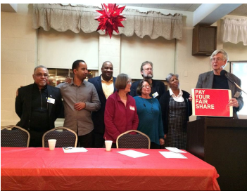
Participants in the Schenectady Campaign for Equity in

The Schenectady Campaign for Equity in Education is a coalition effort to advocate for increased support for the Schenectady School District with amounts promised but not provided through a state funding formula. Schenectady, as a number of other urban districts upstate, is promised additional funds to address the disproportionate effects of poverty, race, and disability; and the higher burden of taxation. The coalition continues to monitor how the additional funds are spent to improve outcomes for students.