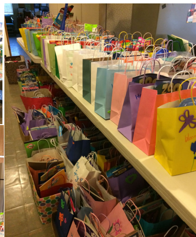
325+ Spring Bags were filled and distributed to children using the Food Pantry during their vacation week, and made many happy!