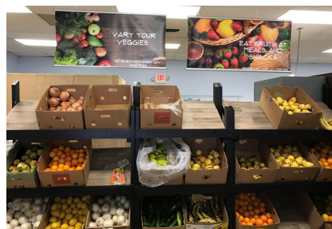
Food Pantry produce window