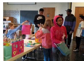
Volunteers assemble Spring Bags

Many thanks to all those who helped make SICM's 4th Annual Day of Service a big success! Whether you baked, raked, setup, swept, lugged or bagged, your hard work was appreciated. Carrie Street Park, Steinmetz Park, Jerry Burrell Park, Hamilton Hill