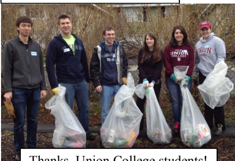
Thanks, Union College students!