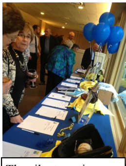
The silent auction offered many choices