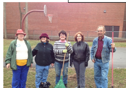
The Mt. Pleasant Neighborhood Association spruced up Quackenbush Park.

Church, Emmanuel Friedens Church), Union College (including the Catholic Student Association), Schenectady County Community College (the Science Club), Mt. Pleasant Neighborhood Association and others, took time on a dreary Saturday morning to work tirelessly in an effort to make the parks a nicer place for Schenectady children to enjoy their lunch this summer. Also thanks to the City of Schenectady, Commissioner