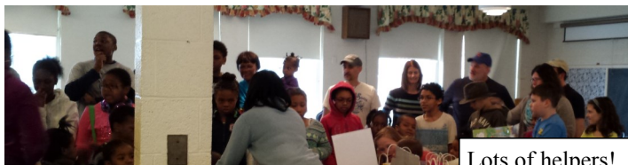
Lots of helpers!

These individuals, from several local congregations (First Reformed-Schenectady, Faith United Methodist Church, Eastern Parkway United Methodist