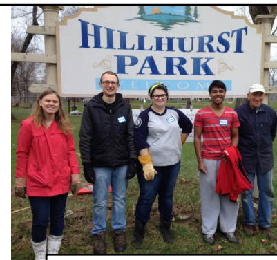
Thanks, SCCC Science Club!