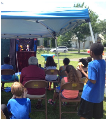
The Puppet People helped with the celebration!

years ago in Central Park. Girl Scout Troop 1785 of Colonie provided face painting; and the Puppet People of Schenectady, also celebrating their 20 th year, provided a puppet show! United Way of the Greater Capital Region donated special tote bags to all the children, and we had two bounce houses for the children to enjoy. Finally, no party is complete without cupcakes, secured from the Mont Pleasant Bakery.