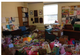
Over 300 Spring Bags were distributed to children using the Pantry.

Many thanks to all those who helped make SICM's 4th Annual Day of Service a big success! Whether you baked, raked, setup, swept, lugged or bagged, your hard work was appreciated. Carrie Street Park, Steinmetz Park, Jerry Burrell Park, Hamilton Hill