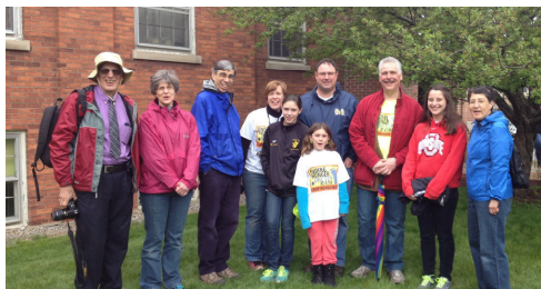
United Methodists gather!