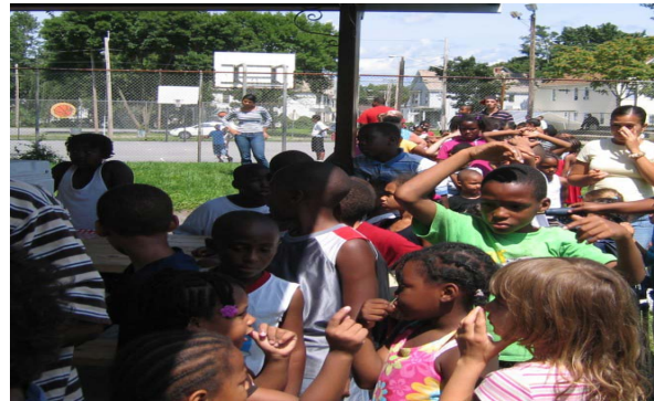
SICM Summer Lunch at Jerry Burrell Park

The goal of Project S.K.I.P ( Schenectady Kids Imagine and Play ) is to renovate Jerry Burrell Park in the Hamilton Hill neighborhood of Schenectady and to build a new playground for underserved children. A small group of Union alumni and current students have partnered with Weed and Seed, the Schenectady Inner City Ministry (SICM), the City and County of Schenectady, Union College, and others to make the renovation and playground possible. To date, over $80,000 has been raised and we are eagerly anticipating building the playground in literally one day (May 22, 2010)!